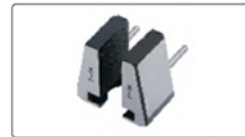
flat jaws (included)