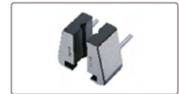
V-shaped jaws (included)